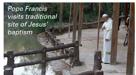
Pope Francis visits traditional site of Jesus' baptism

Christian baptism signifies entering into the life of the risen Christ and becoming a member of Christ's disciples today.