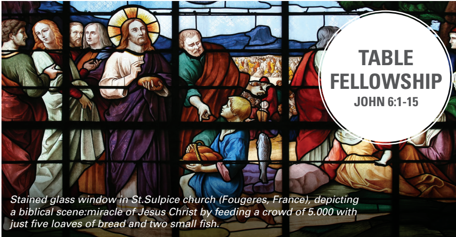
Stained glass window in St. Sulpice church (Fougères, France), depicting a biblical scene: miracle of Jesus Christ by feeding a crowd of 5,000 with just five loaves of bread and two small fish.

All four Gospels have at least one story of Jesus feeding the crowd. Mark and Matthew have two. The story is the same but, like good story tellers, each Gospel writer introduces subtle but important changes into his version. John's is the longest, as it includes a long dialogue about the meaning of the Bread of Life. We will read it over the next five Sundays.