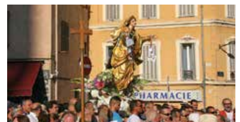
The statue of the Virgin Mary is escorted during the annual Assumption procession in the Le Panier district of Marseille, France.

Today we celebrate the feast of the Assumption of Mary. We celebrate our belief that Mary was taken up, body and soul, into heaven, where she enjoys eternal life in the company of her Son. It is a joyful feast for us Christians because it points to what we believe will be our destiny. We believe that what God has done for Mary, he will do for us also. That at the end of time God will raise our mortal bodies and bring us into the fullness of his life forever.